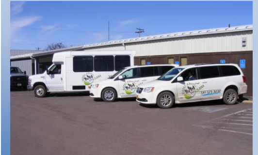
Harney County Dial-a-Ride